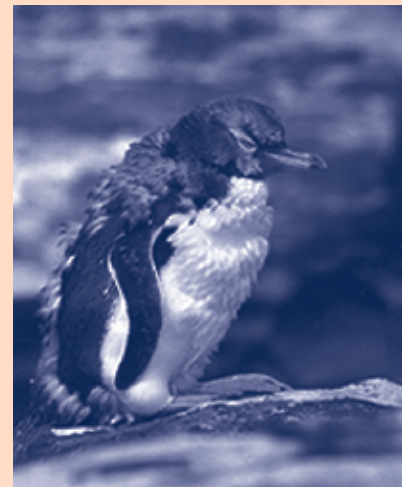
The yellow-eyed penguin, or hoiho, made famous in a Mainland cheese advertising campaign, is a local resident of the Catlins. The bird and its habitat will be protected by the new Centre project.

http://www.workandincome.govt.nz/community/a-z-grants-and-other-help/enterprising-communities-grant.html